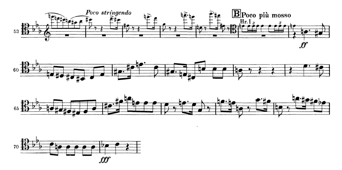
*to be played alongside RLPO Musician

Guidance notes: "This musical statement must be declared forthright"