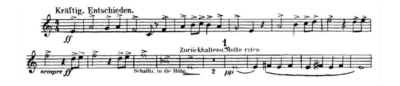
Symphony No 3 Mvt 1 - 1^{st} Horn in F

Please prepare sections marked in brackets [] where indicated. If no brackets are marked please prepare entire excerpt.