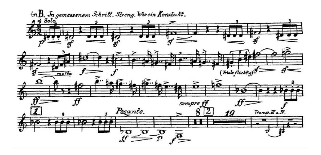
Symphony No 5 Mvt 1 - 1^{st} Tpt in Bb

Please prepare sections marked in brackets [] where indicated. If no brackets are marked please prepare entire excerpt.