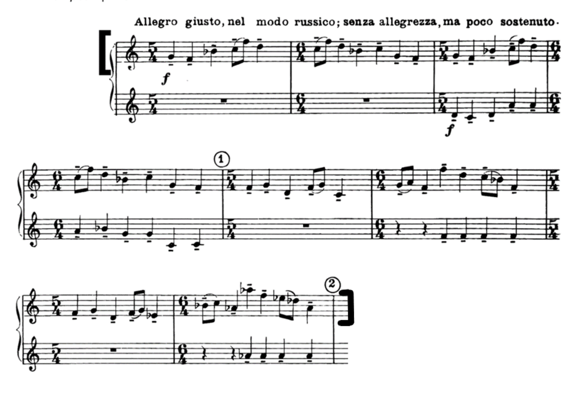
Trumpet 1 | In C

Please prepare sections marked in brackets [ ] where indicated. If no brackets are marked please prepare entire excerpt.