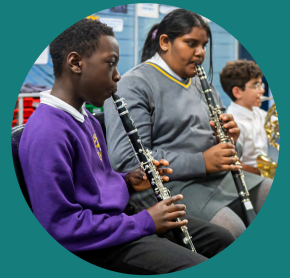
▲ Members of In Harmony at Youth Hub, October 2022

One In Harmony participant (a viola player, age 13) attended the Sistema Europe Youth Orchestra residential course in Madrid, which culminated in a high-profile concert featuring over 140 young musicians from across Europe. 12 In Harmony children were entered for a total of 13 graded music exams between Grade 1-6. All achieved a pass or higher, with two gaining distinctions.