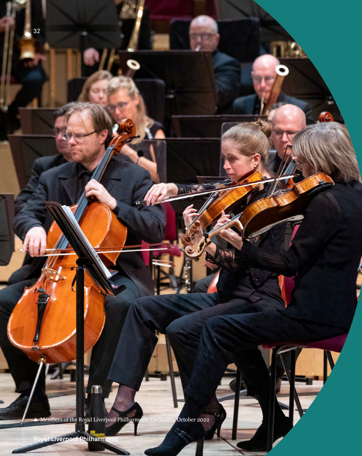
▲ Members of the Royal Liverpool Philharmonic Orchestra, October 2022