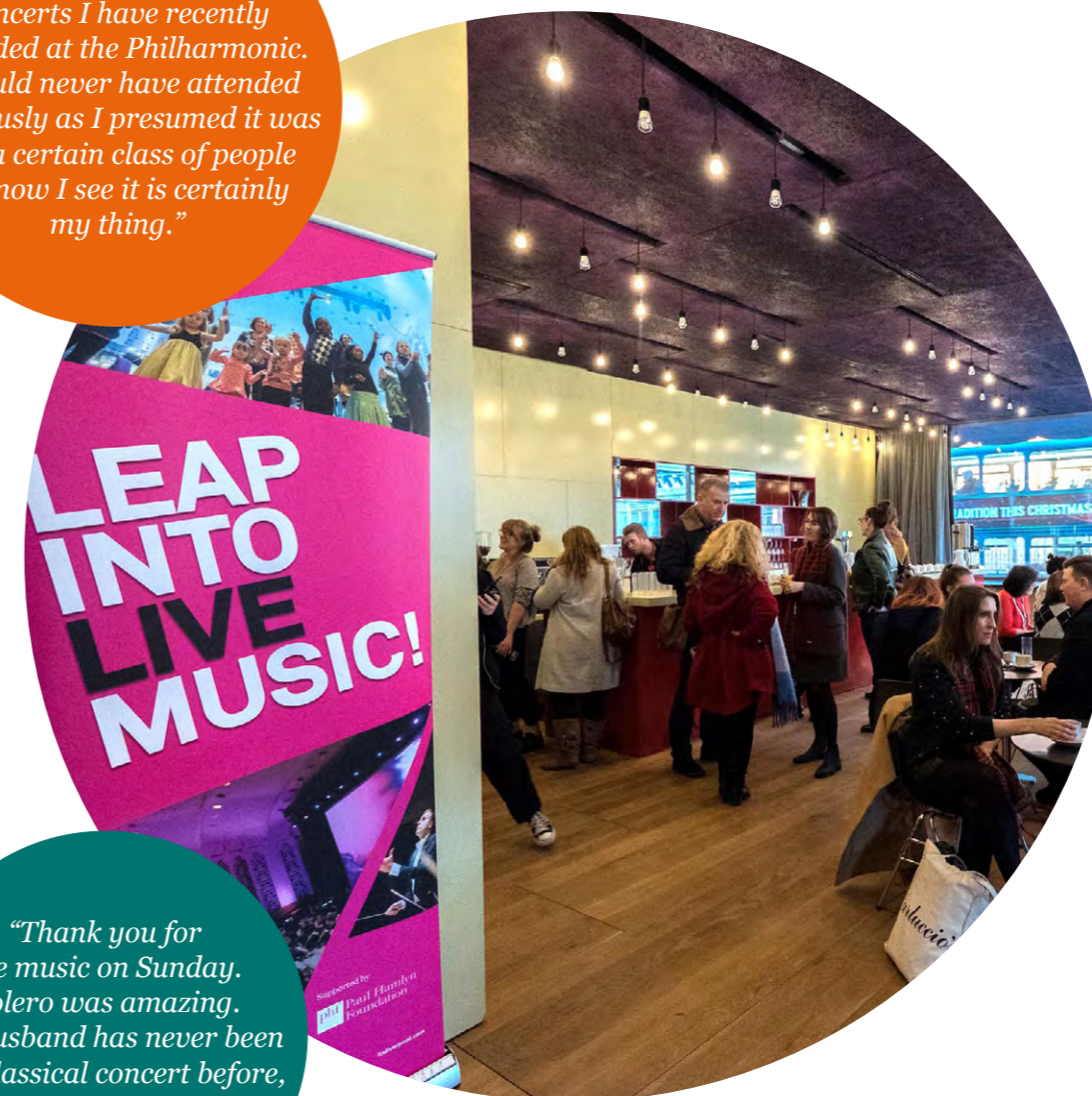
▲ Leap into Live Music Event in the Music Room

"Thank you for the music on Sunday. Bolero was amazing. My husband has never been to a classical concert before, I don't think that it will be his last."