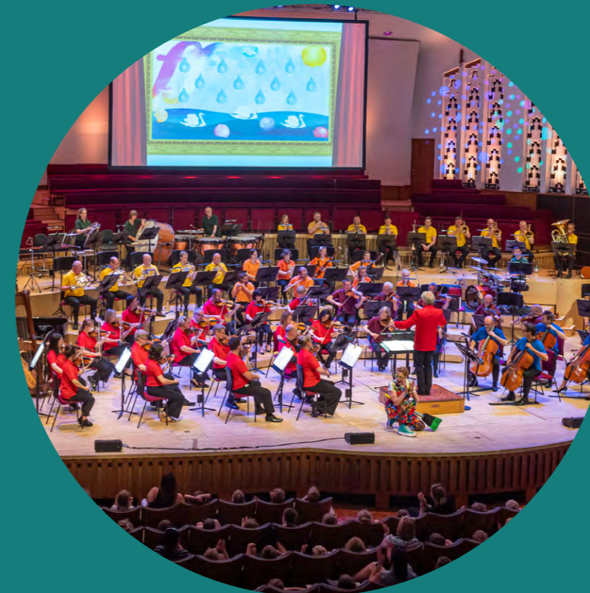
▲ Liverpool Philharmonic Schools' Concerts 2022

Our much-loved schools' concerts made a welcome return to Liverpool Philharmonic Hall in 2022. 17,726 children and teachers from 176 different schools across the region visited us this year across 13 enjoyable and educational concerts.