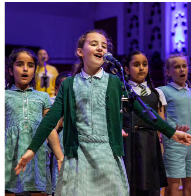
▲ Resonate Music Hub iSing event