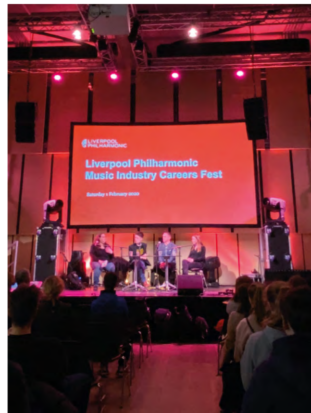
▼ Music Industry Careers Fest

In February, we held our annual Careers Fest, curated in partnership with LIMF Academy . The event offers young people the chance to learn more about careers in music, network with leading industry professionals and meet other like-minded young creatives. This year's Careers Fest featured speakers from LIMF Academy, Meta (Facebook and Instagram), Ivors Academy, PRS For Music, and 3 Beat, and included interactive and informative sessions, with live music at lunchtime followed by a hands-on lighting and tech workshop in the auditorium.