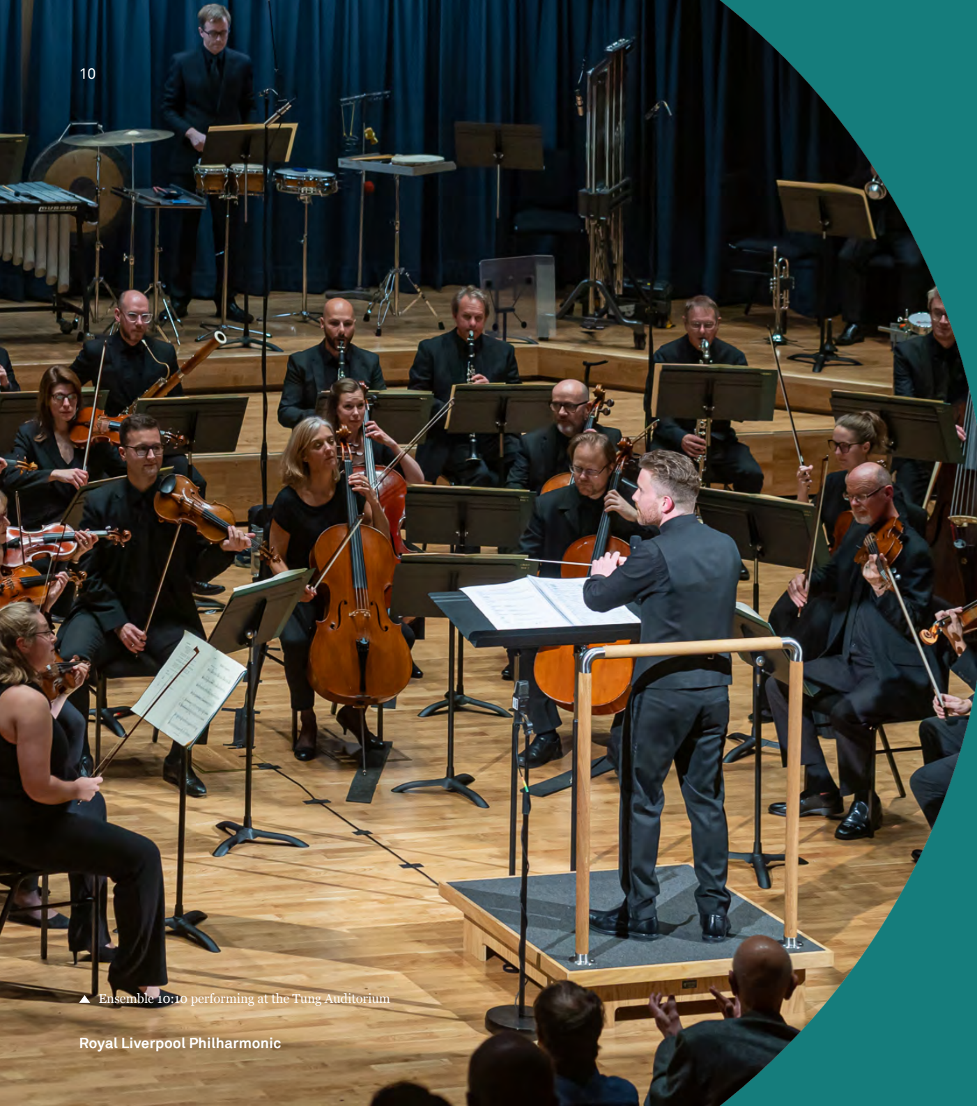
▲ Ensemble 10:10 performing at the Tung Auditorium