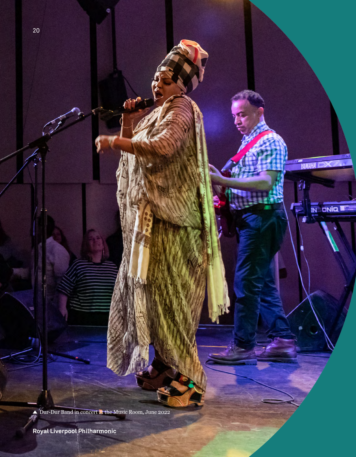
▲ Dur-Dur Band in concert at the Music Room, June 2022