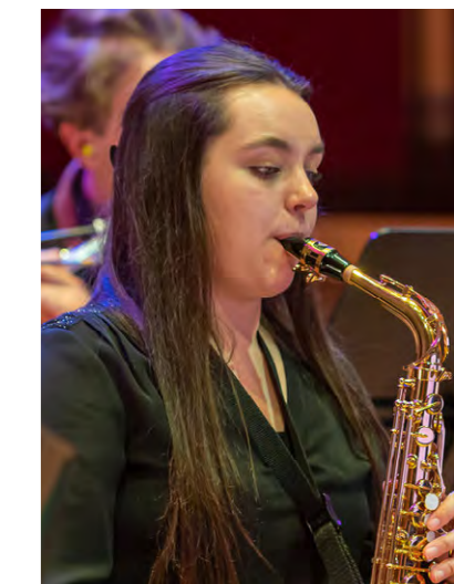
▲ Members of Liverpool Philharmonic Youth Company