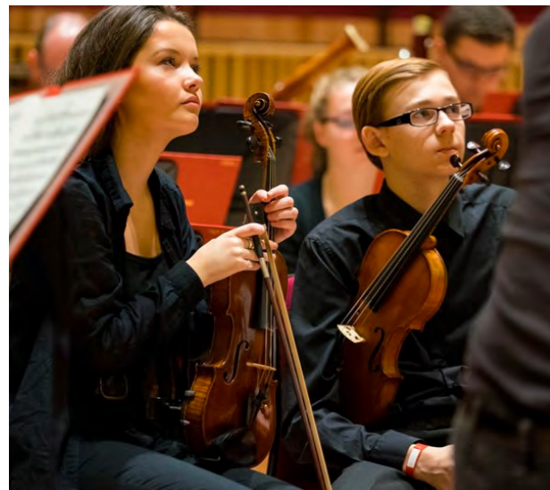
▲ Youth Company members during rehearsal