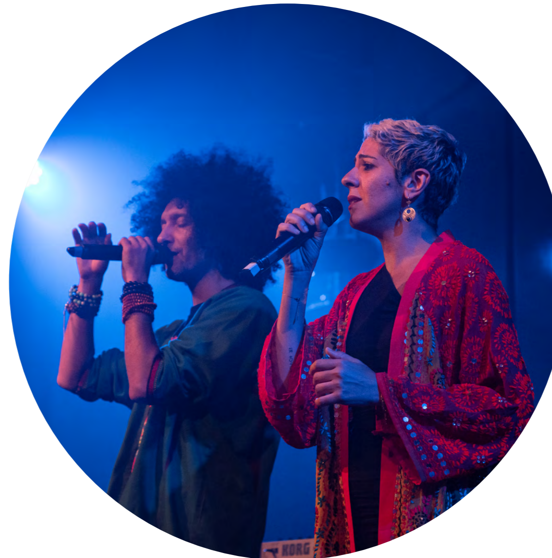
▲ N3rdistan performing at the Liverpool Arab Arts Festival

We have created a detailed Inclusivity and Relevance Plan which is delivering outcomes in a range of areas: