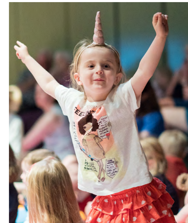
▲ Children enjoying one of our Under 5s concerts

"I can see the Spooktacular concert becoming an annual tradition for us! So much fun for the children, parents and grandparents alike!" – Audience Member