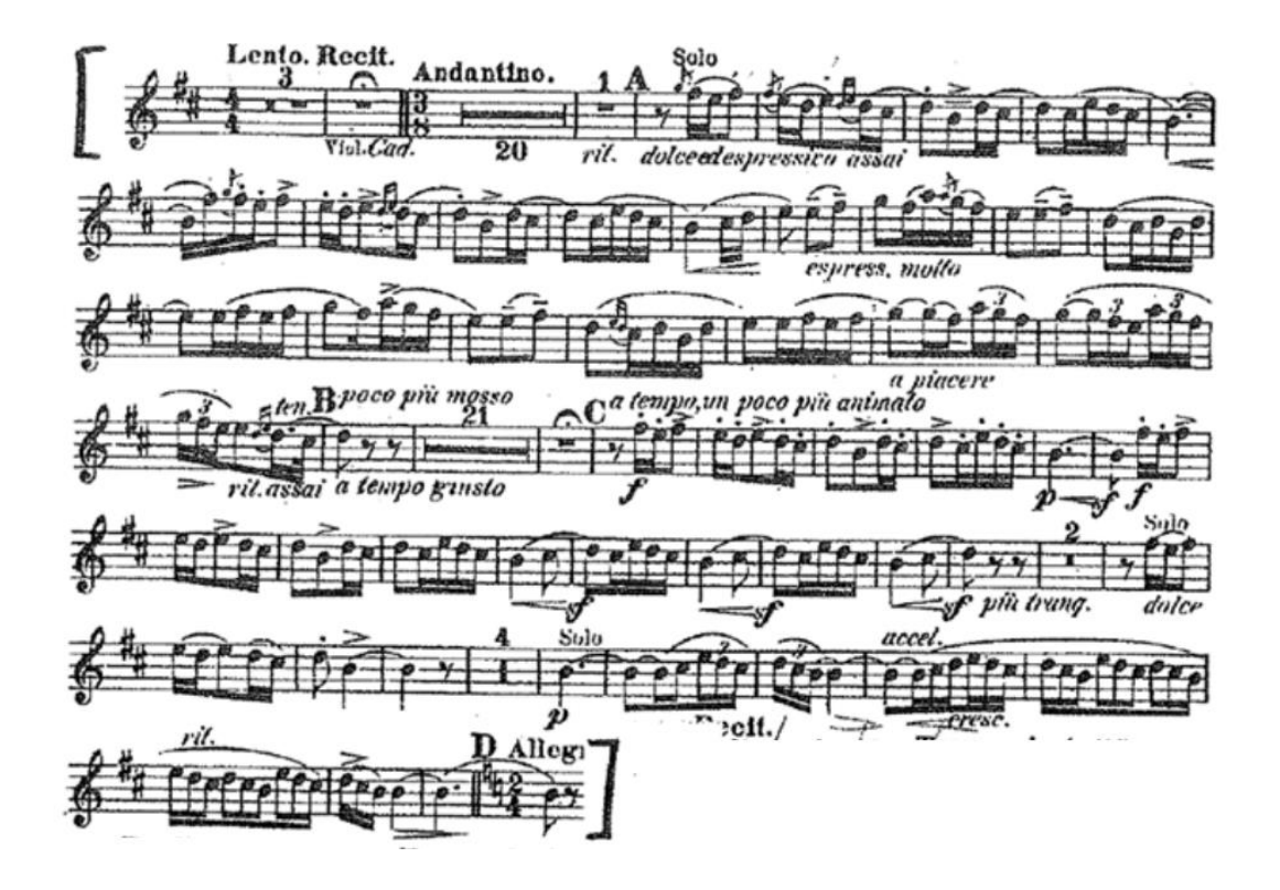
Scheherazade Mvt 2 – 1<sup>st</sup> oboe